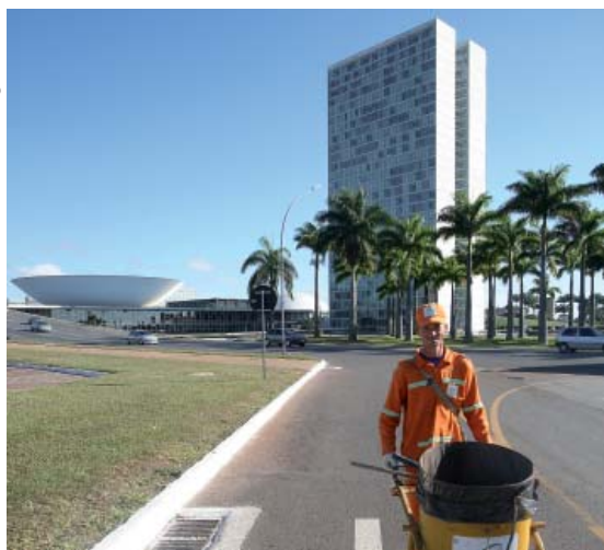
Efforts to promote M&E should work with the country's own systems and structures, rather than trying to create new ones

In 2005, the World Bank launched Brasil Avaliação (BRAVA), a modest technical assistance initiative to help the government of Brazil strengthen country systems for monitoring and evaluation (M&E). The programme also hopes to promote a culture of M&E in order to provide feedback on the performance of key programmes, to promote accountability, and to inform government spending decisions.