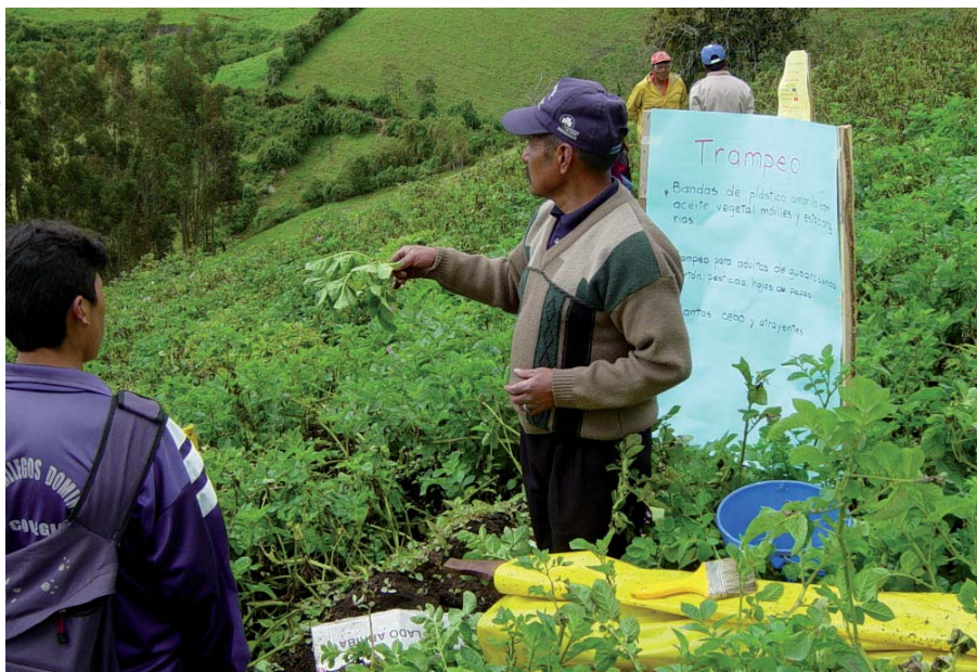
Outcome Mapping can be replicated in a diverse range of settings and contexts.