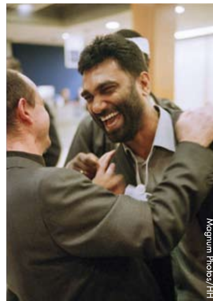
Kumi Naidoo of Civicus is a leader who promotes accountability for development.

Even where there are no agreed rules, initiatives to establish evidence are potentially powerful means to focus attention and energies. Performance assessments, functional reviews, public expenditure reviews, gender budget analyses, programme evaluations and peer reviews are all means for establishing a degree of certainty around information that is of public interest. The degree of independence