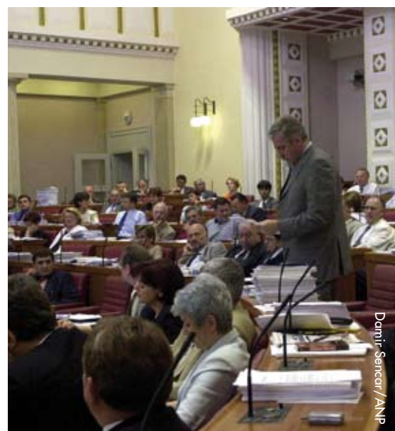
Croatian MPs – a target group for the IPF newsletter.

ministries, budget users, and citizens (NGOs, local government associations, the media, etc.) and define a working plan.