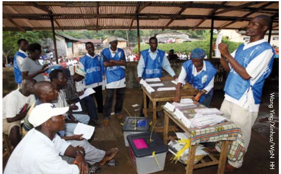
Election observers at a polling station in Freetown.