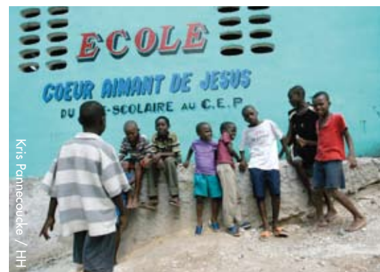
Haiti: children in front of their school.

workable complementarity between the state, CSOs and the international community. The approach currently being taken in the Poverty Reduction Strategy is to engage both the government and CSOs as partners in the pursuit of common goals. This strategy aims to enhance the capacity of the government while recognising the existing social functions, independence and the political advocacy role of the CSOs.