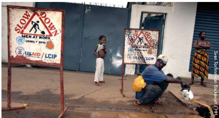
'Operation Pothole': former soldiers and rebels are now employed to repair roads in Monrovia.

In Liberia, these services are currently provided by the government, the private sector and a variety of civil society organisations, including faith-based institutions. For the moment we do not want to change this situation because if you look at the costs involved, the government does not have the capacity to be the only provider. In this phase of our development that is not a critical issue. But we do want to keep an eye on the quality of their services. The government has to focus on the regulatory aspects and on monitoring quality.