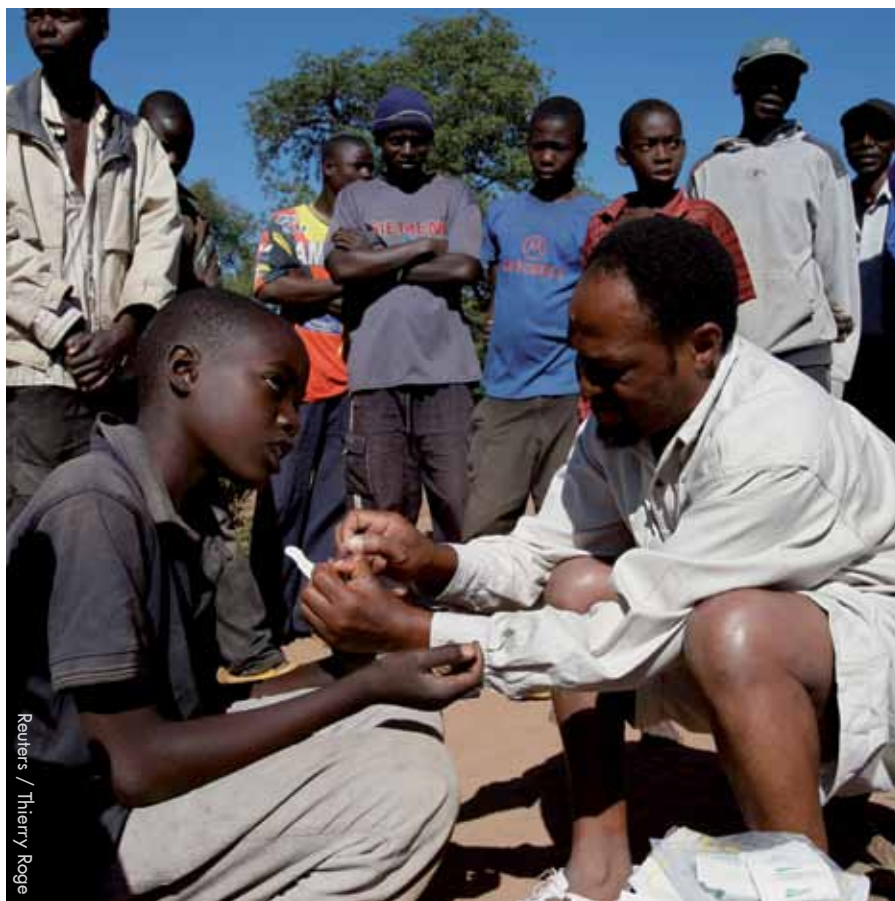
A Zambian health care worker tests for malaria

Public health institutions in Zambia have also been supported to upgrade their structures. Family Health International (FHI),