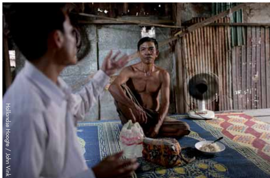
A MoPoTsyo health care worker gives insulin to a Cambodian fisherman with diabetes

Independent assessments based on random samples of registered patients show a relatively consistent pattern of health improvements. Despite low levels of literacy, PEN members have a better understanding of their condition and of how to improve their health and lifestyle. Taken together in all random assessments, average blood glucose